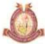
University of Kashmir